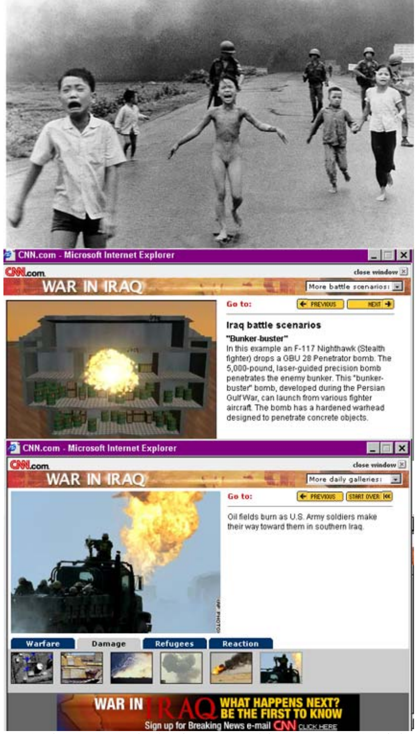
Fig. 9: Above: An example of media coverage of the Vietnam war 1972, below: an example of media coverage of the Iraq war 2003

In the Information Age fast streams of images are all-present, hence controlling and influencing what is being broadcast and printed has become a much harder task. Nonetheless US officials and most US media try to keep away such images from US TV screens and minds. Condemning the coverage of Iraqi TV and Al Jazeera seems not to have been primarily motivated by humane concerns, rather fears that a second Vietnam-like media influence seem to have resulted in the above documented reactions. The concerns were mainly about avoiding negative propaganda that could lower public support of warfare. US officials and media argued in favor of demonstrative harmlessness and inoffensiveness, they