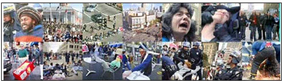
Fig. 6.: A series of images that portrays anti-war protests in a strongly negative way