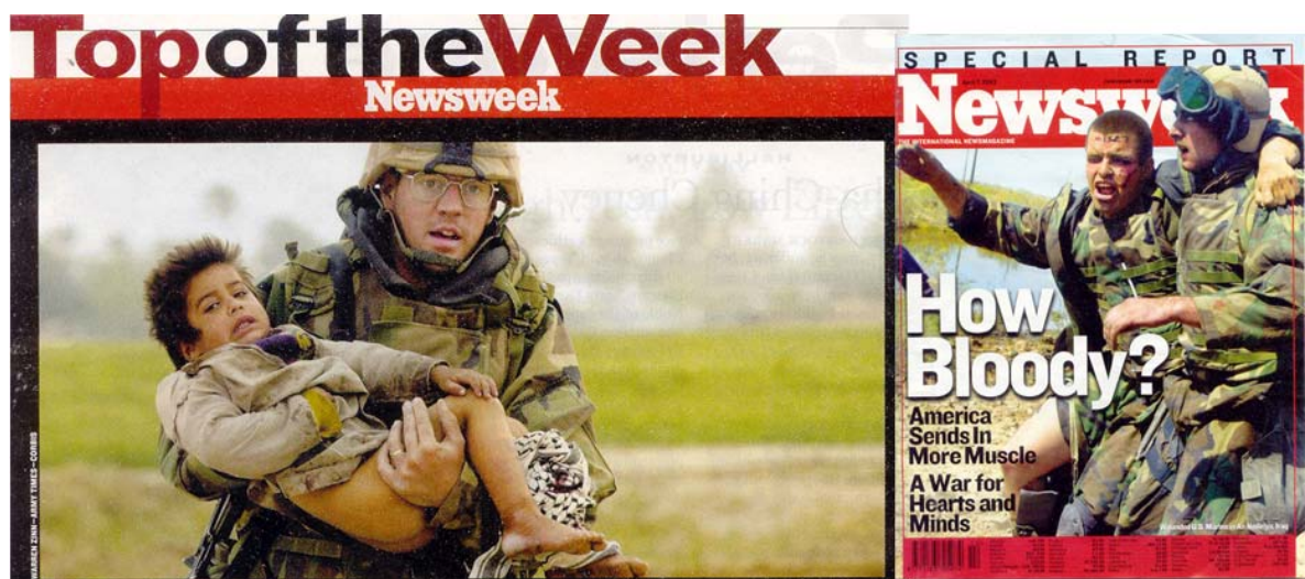
Fig. 1: The new "human(e) touch" of war coverage