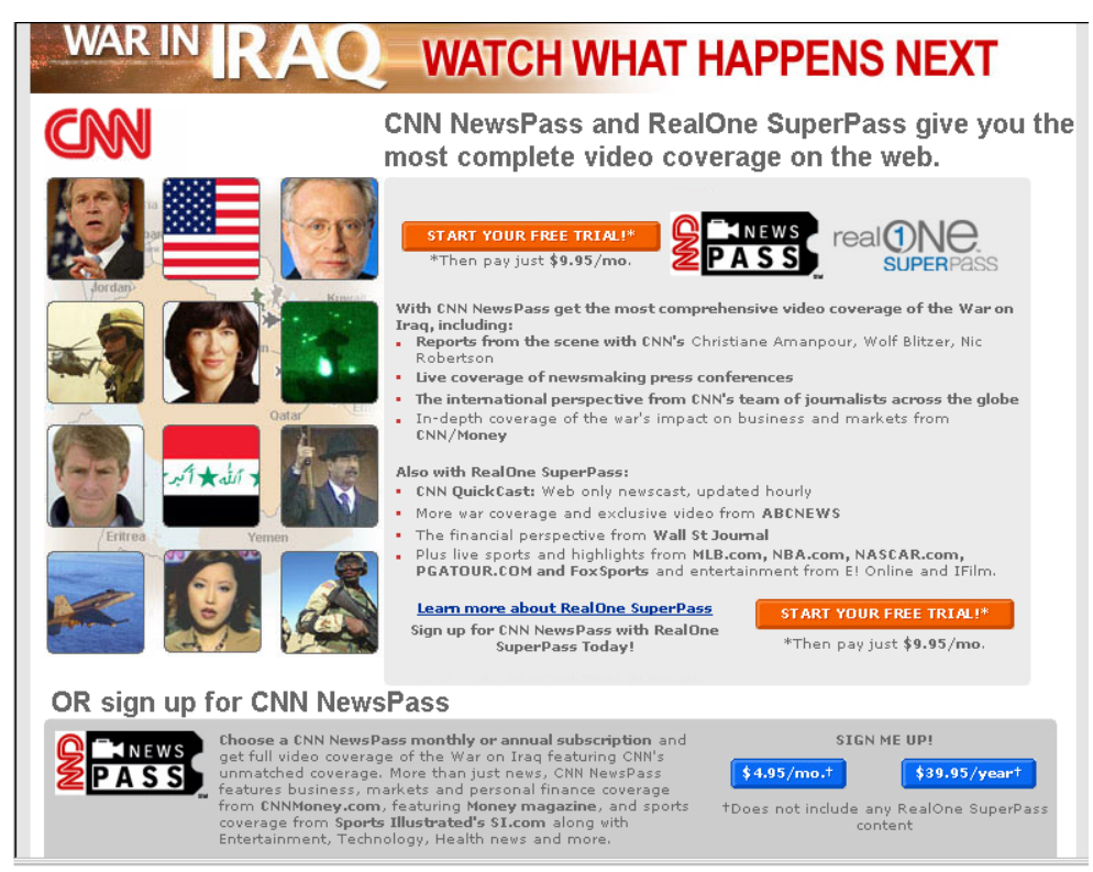
Fig. 3.: War as home entertainment-commodity

TV networks like CNN have established special filtering systems. "A new CNN system of "script approval" – the iniquitous instruction to reporters that they have to send all their copy to anonymous officials in Atlanta to ensure it is suitably sanitised – suggests that the Pentagon and the Department of State have nothing to worry about" (Fisk 2003).