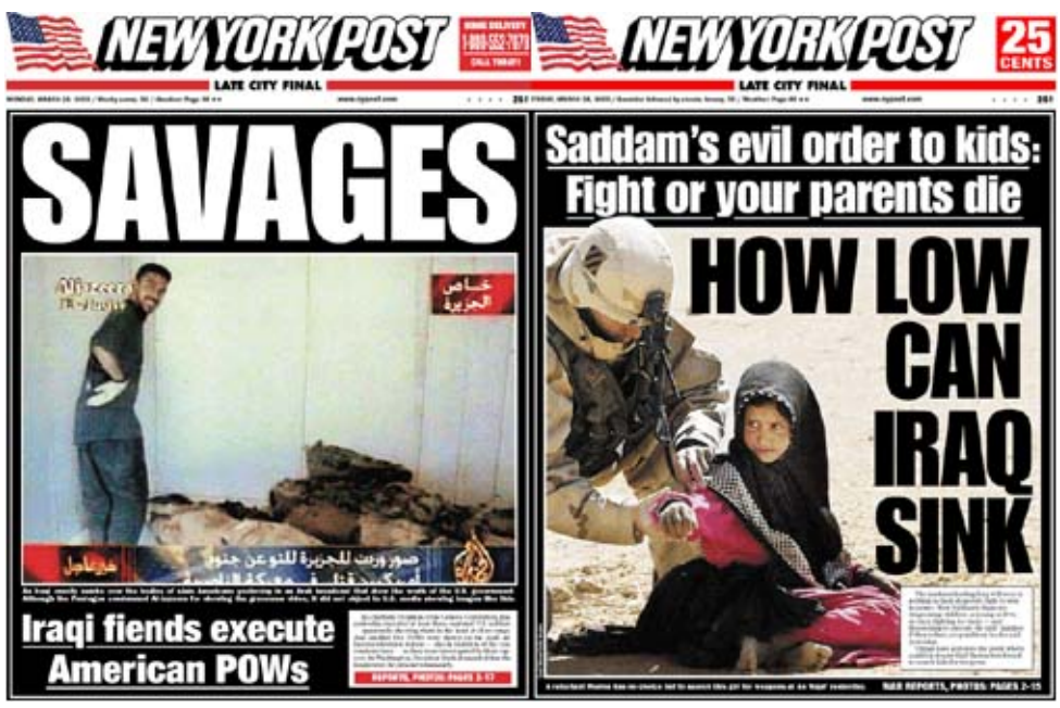
Fig. 8.: Manufacturing negative images of the opponent. Covers of the New York Post, March 24^{th} and 28^{th}

killed and bombed. Some days later the NY Post's headline was similarly emotionally and ideologically loaded (cf. fig. 8).