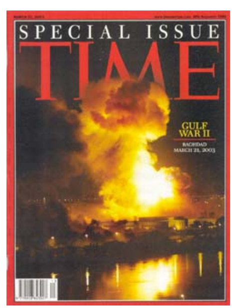
Fig. 2: War as a spectacle