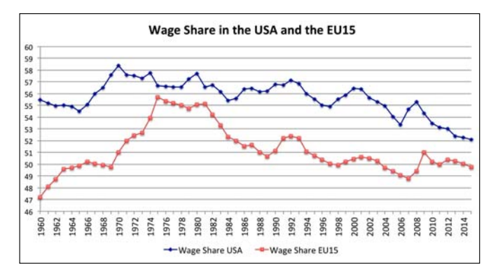
Figure 2: The share of wages in the GDP in the USA and the EU over time

An alternative explanation takes political economy seriously. For this purpose, the approach of critical political theorist Franz L. Neumann in his 1957 essay <u>Anxiety and</u> <u>Politics</u> is helpful. The rise of right-wing authoritarianism according to this explanation has to do with the alienation of labor (see Figures 2 and 3); destructive competition; social alienation that creates fear of social decline; political alienation from the political system, politicians, and political parties; and the institutionalization of anxiety by far-right groups that stoke fears and advance the politics of scapegoating.