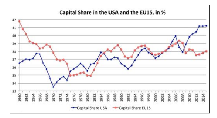
Figure 3: The share of capital in the GDP in the USA and the EU over time