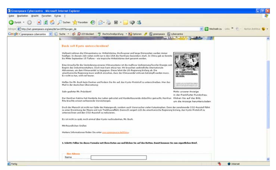
Fig. 6 Greenpeace Germany Cybercentre: Online Petition ("Bush Shall Sign Kyoto!")